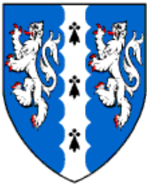
The Alley Arms Exeter